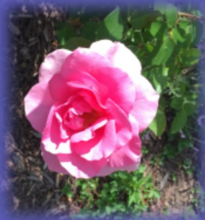
One of my rose bushes