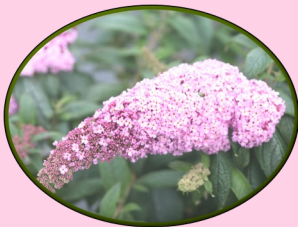
Pugster Amethyst Butterfly Bush