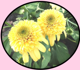
'Lemon Drop' Coneflower